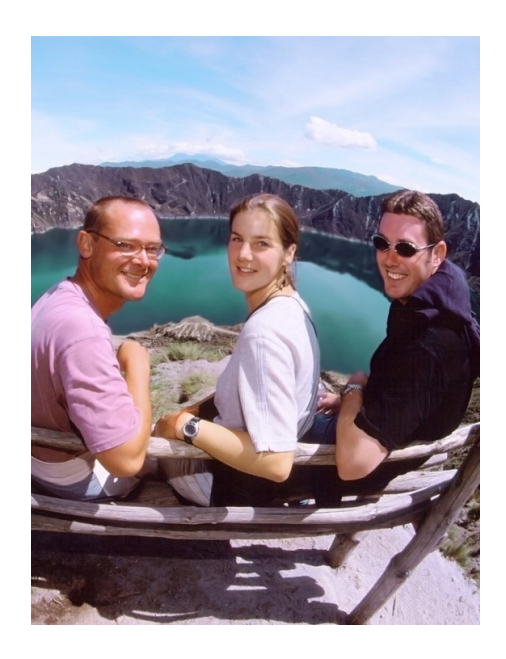
Day 3: Baños: Waterfalls & Scenic Views (B/L/-)

A scenic drive through the central Andes takes you to Quilotoa, where you will admire the incredible, turquoisecolored lake inside the volcano's caldera. Enjoy the ever-changing water's color, perfectly contrasting with the breathtaking Sierra views and peaks.