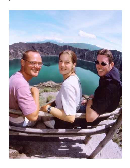
Day 3: Baños: Waterfalls & Scenic Views (B/L/-)

A scenic drive through the central Andes takes you to Quilotoa, where you will admire the incredible, turquoise-colored lake inside the volcano's caldera. Enjoy the ever-changing water's color, perfectly contrasting with the breathtaking Sierra views and peaks.