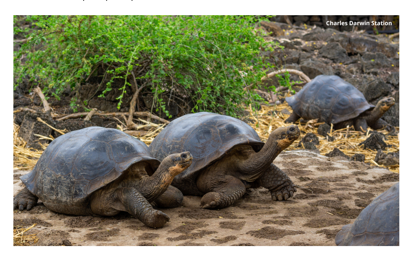
PM: Charles Darwin Research Station

Arrival at the airport, pick up and transfer to the selected Hotel on Santa Cruz, lunch.