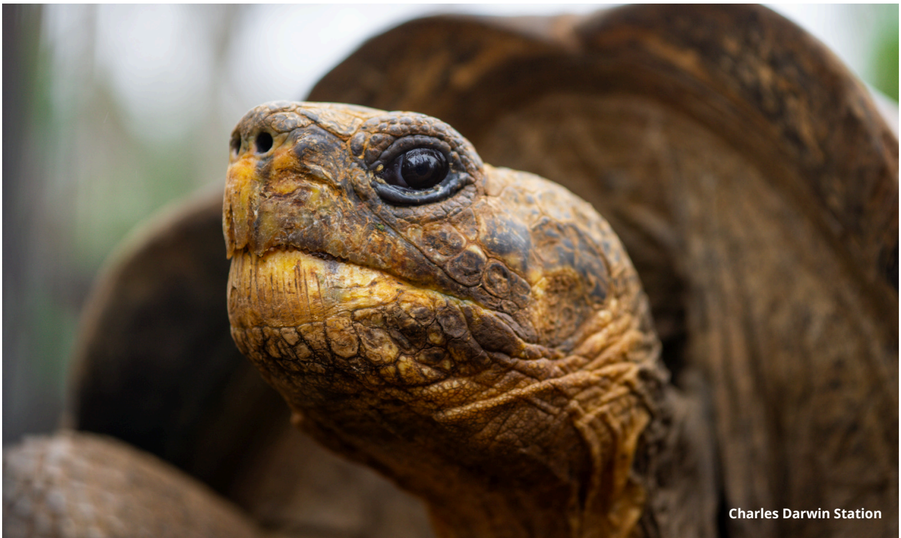
Charles Darwin Station

Arrival at the airport, pick up and transfer to the selected Hotel on Santa Cruz, lunch.